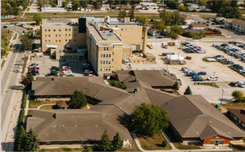
Photo: St. Anthony's General Hospital and St. Pauls Residence. Also known as The Pas Health Complex